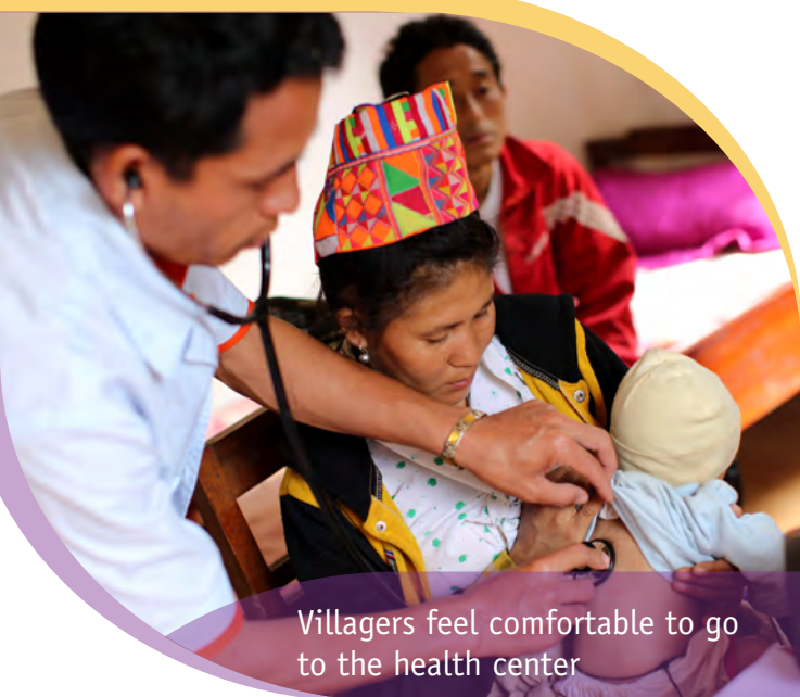
Villagers feel comfortable to go to the health center