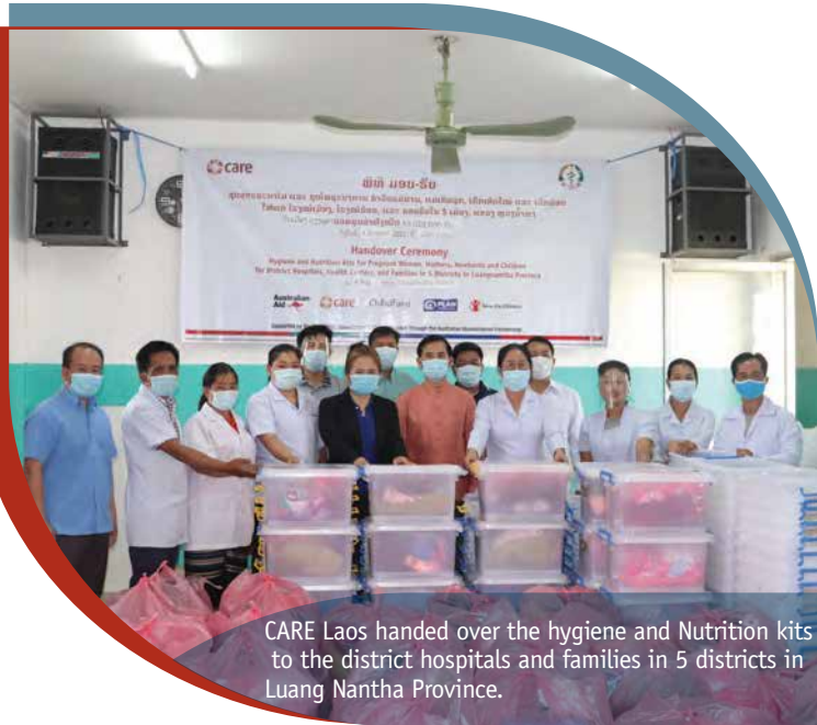
CARE Laos handed over the hygiene and Nutrition kits to the district hospitals and families in 5 districts in Luang Namtha Province.