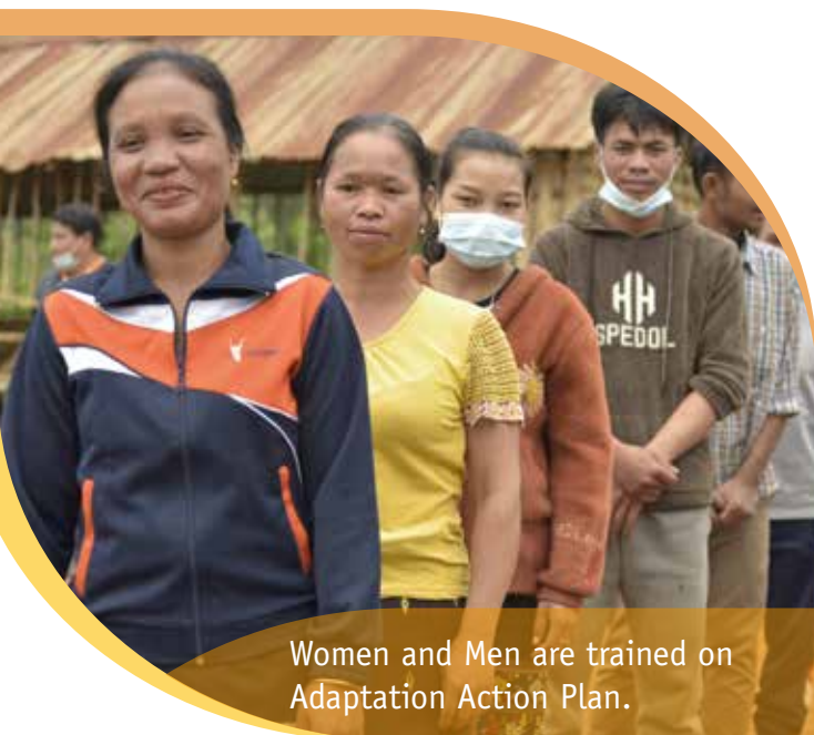
Women and Men are trained on Adaptation Action Plan.