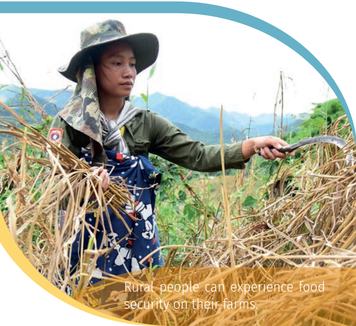
Rural people can experience food security on their farms.