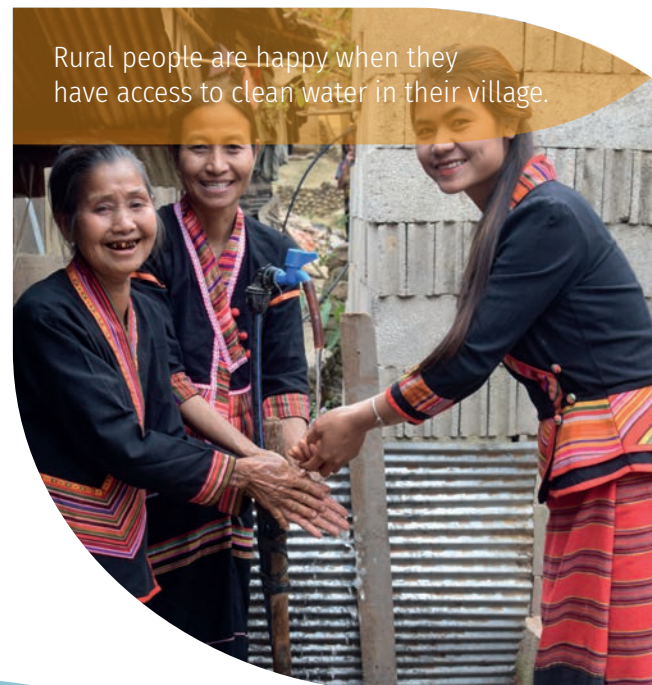
Rural people are happy when they have access to clean water in their village.

CARE International in Lao PDR Vientiane Office P.O Box 4328, Nongsangthor Rd Ban Nongsangthor, Saysettha District, Vientiane, Lao PDR Tel: (+856-21) 217 727