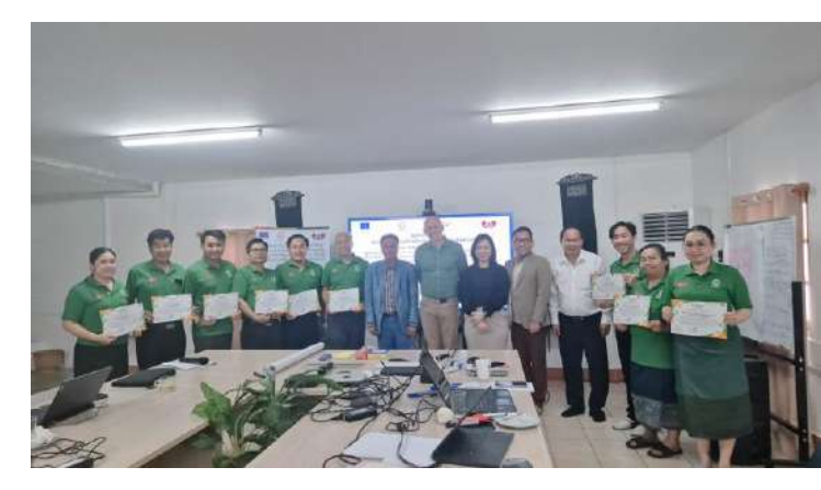
Training on Management of Self-Learning Course for Team and Partners