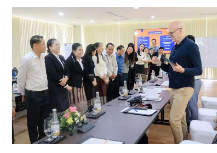
Annual two-week training on Green Reporting for Lao journalists from the northern part of Laos