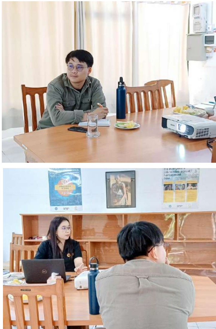
GAMCIL project met with the project coordinator from the Lao Civil Society Organizations

On May 14, 2025, the GAMCIL project met with the project coordinator from the Lao Civil Society Organizations (LCCO) at CARE Laos, Vientiane. The purpose of this meeting was to plan the implementation of project with activities together the project coordinator from LCCO to coordinate with members of LCCO to select associations to participate in training on green issues, digital literacy and media governance as well as other ongoing activities under the GAMCIL project that will be implemented from June 2025 to February 2026.